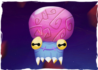
Flash The Snailer – beware of those hypnotizing big eyes and sharp teeth, he shoots to kill