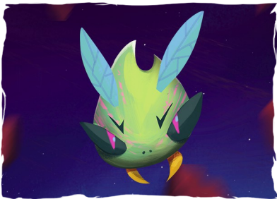
The Terrible Vaspler – always giving you the intergalactic stink eye, charging with sharp fangs

You'll be battling four different alien creatures and you'll have two space ships at your disposal. You need to use your superior reflex and shoot down the aliens attacking you before they shoot you. Don't let them get to you or it's game over – and there's no hope left for your planet! Game might be challenging in the beginning, but don't get discouraged and fight to save your planet! Play tirelessly and unlock new achievements and gain new guns that will help you prevail and beat the enemy!